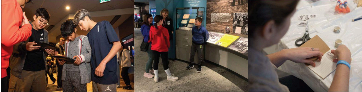
Right photo by Shay Markowitz for the Toronto Holocaust Museum